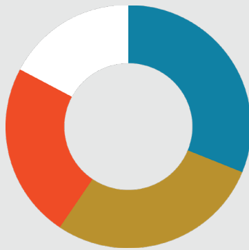
2022 REVENUE BY CATEGORY